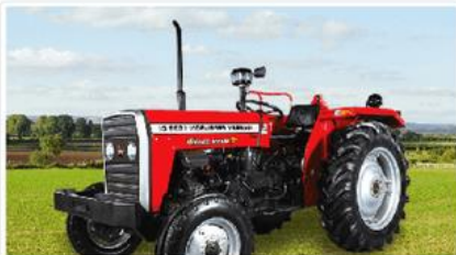
Product For Tractor Industry