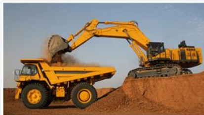
Product For Earth Moving Equipment