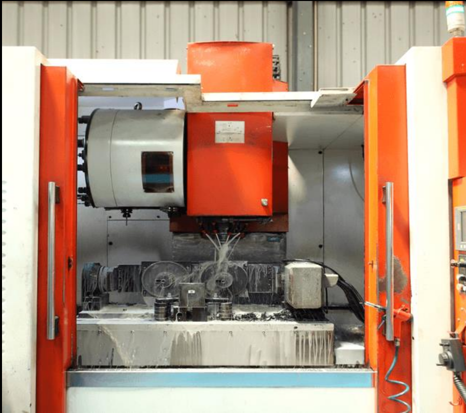
VMC MACHINING ON ROTARY MACHINE