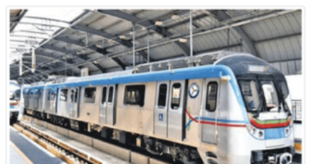
Product For Railway Industry